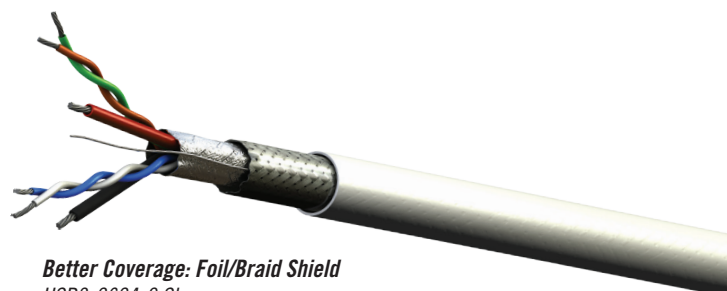
Better Coverage: Foil/Braid Shield USB3-2624-9 Shown