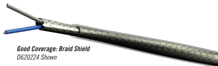
Good Coverage: Braid Shield D620224 Shown

What's the importance of all this? In the complex RF environment of an ever-growing rat's nest of signals, often bundled together and "sharing" noise, better shielding improves signal integrity and system reliability.