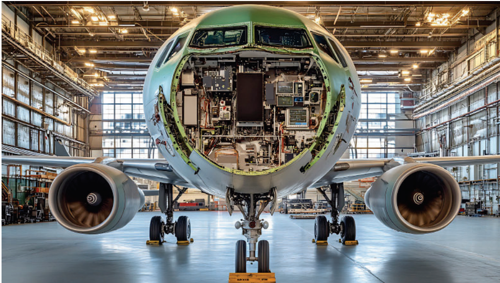
Figure 1. Updating aviation electronics doesn't have to mean sacrificing on space and weight.

Each year, new sensor suites and electronic hardware packages are added to aircraft designs. While each of these enhances the safety, reliability or fuel efficiency of the aircraft, they also add weight and increase the complexity of the design. With more sensors comes larger wire bundles and more difficult troubleshooting, all jammed into valuable real estate in the aircraft.